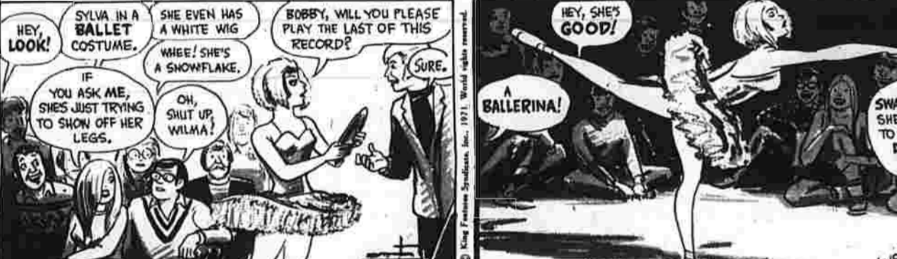
BUZZ SAWYER BY ROY CRANE