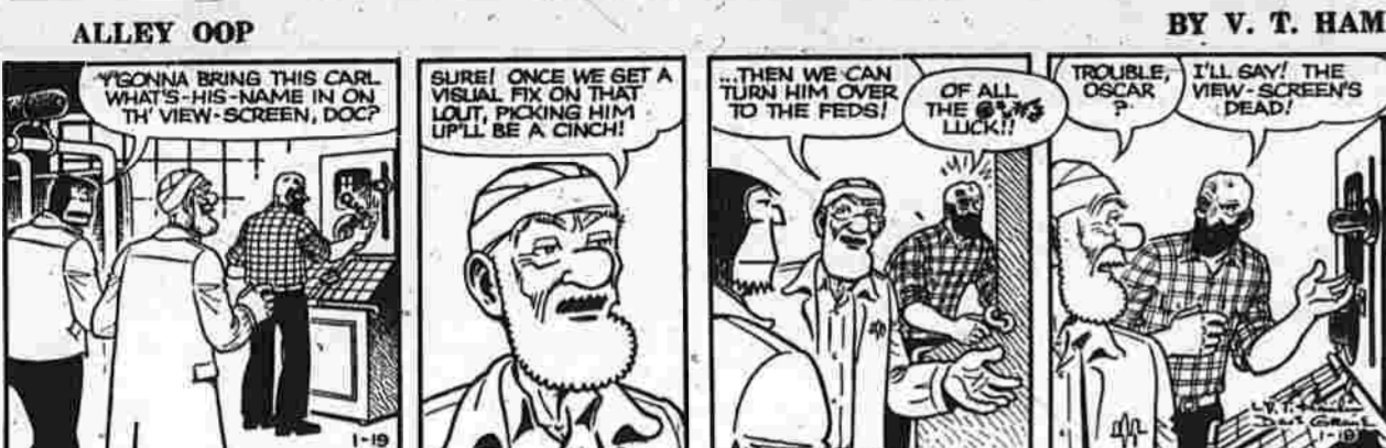
ALLEY OOP BY V. T. HAMLIN