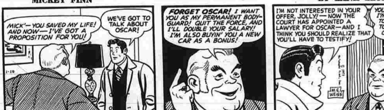
MICKEY FINN BY LANK LEONARD