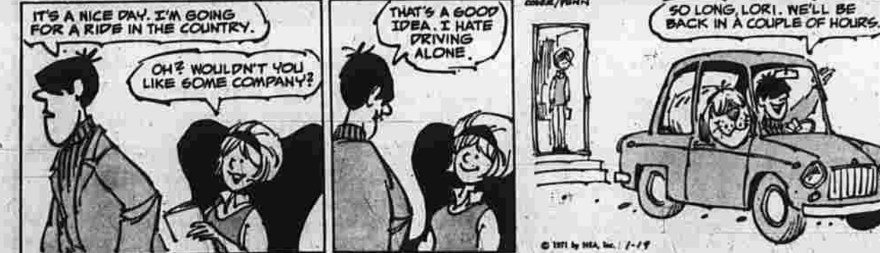
LANCLOI BY COKER AND PENN