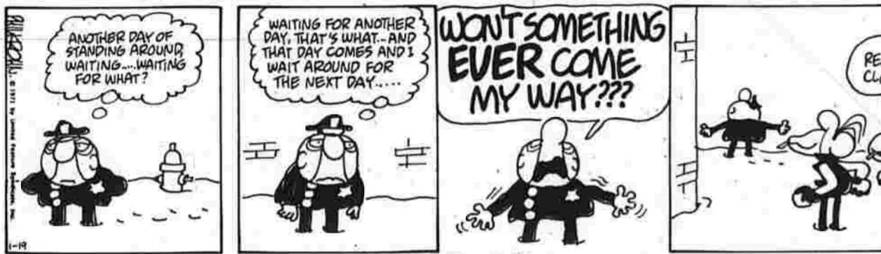
GUMMER STREET BY PHIL KROHN